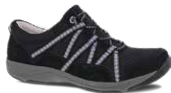
Black Suede 4854-100285 (36-42)