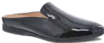
Black Patent 2038-180200 (36-42)