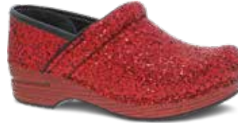
Red Glitter † 306-221094 (36-42)