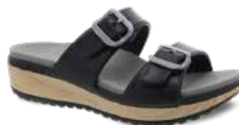
Black Molded 4520-180200 (36-42)