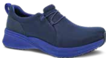
Navy Mesh 1945-757571 (36-42)