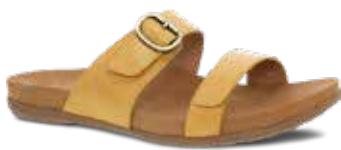
Yellow Calf 6220-170300 (36-42)