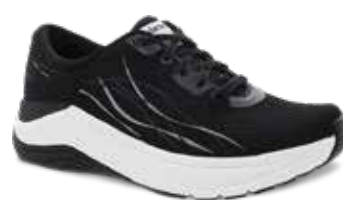
Black Mesh 4205-470200 (36-42)