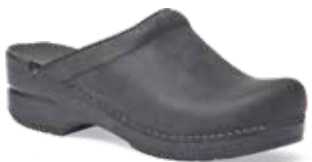
Black Oiled 247-020202 (35-42)