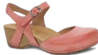
Coral Milled Burnished 1710-481600 (36-42)