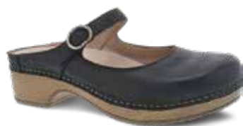
Black Burnished Nubuck 9435-101600 (36-42)