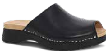
Black Nappa 7187-100200 (36-42)