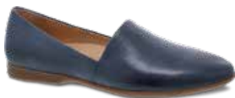
Navy Milled 2036-750600 (36-42)