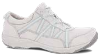
Ecu Suede 4854-619434 (36-42)