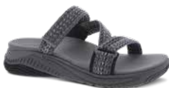
Grey Multi Webbing 4916-941000 (36-42)