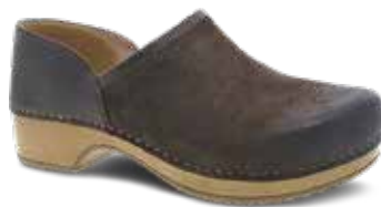
Chocolate Burnished Suede 9431-451600 (36-42)