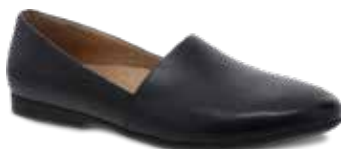
Black Milled Nappa 2036-020200 (35-42) MEDIUM 2046-020200 (36-42) WIDE Available 2/5/24