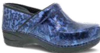
Navy Embossed Patent* 3950-520202 (36-42)