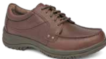
Mocha Full Grain 8706-351000 (41-48)