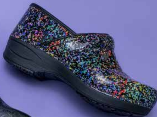
Professional Springtime Patent – page 5