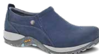
Navy Milled Nubuck 4353-752005 (36-42)