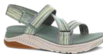
Sage Multi Webbing 4917-130300 (36-42)