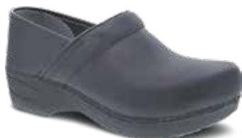
Black Waterproof Pull Up † 3950-470202 (35-43) MEDIUM 3959-470202 (36-43) WIDE