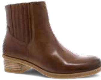
Tan Waterproof Burnished 2931-370300 (36-42)