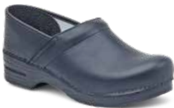
Black Box 006-020202 (*43-48)