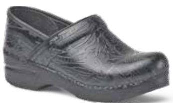
Black Tooled 906-020202 (35-43)