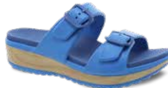
Blue Molded 4520-050500 (36-42)