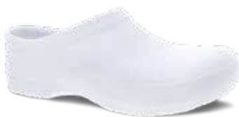
White Molded 4146-010100 (36-42)