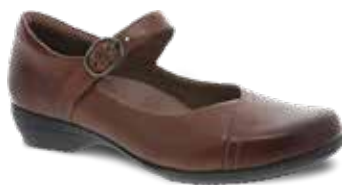
Chestnut Burnished Calf 5501-690200 (36-42)