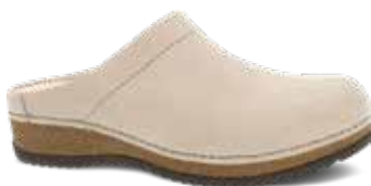
Linen Nubuck 9609-445300 (36-42)