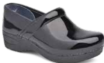
Black Patent 3950-180202 (36-42) MEDIUM 3959-180202 (36-42) WIDE