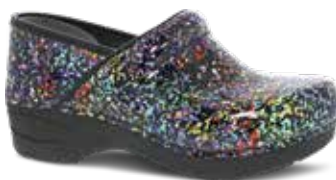
Color Pop Patent* 3950-510202 (36-42) Available 10/23/23