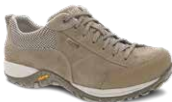
Walnut Suede 4350-207616 (36-42) MEDIUM 4359-207616 (36-42) WIDE Available 11/6/23