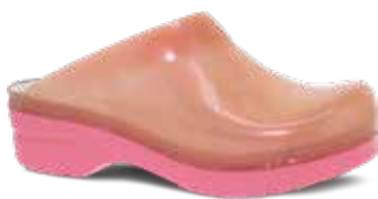
Coral Translucent 047-484848 (36-42)