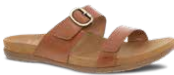
Luggage Calf 6220-640300 (36-42)