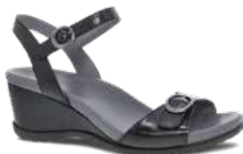
Black Glazed Kid Leather 1613-500200 (36-42)