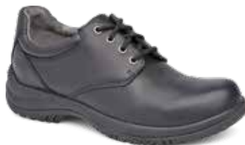
Black Smooth 8704-020200 (41-48)