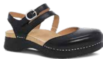
Black Nappa 7188-100200 (36-42)