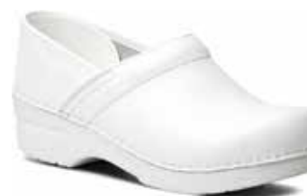
White Box 606-010101 (35-43)