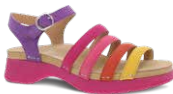
Multi Milled Nubuck 7186-743300 (36-42)