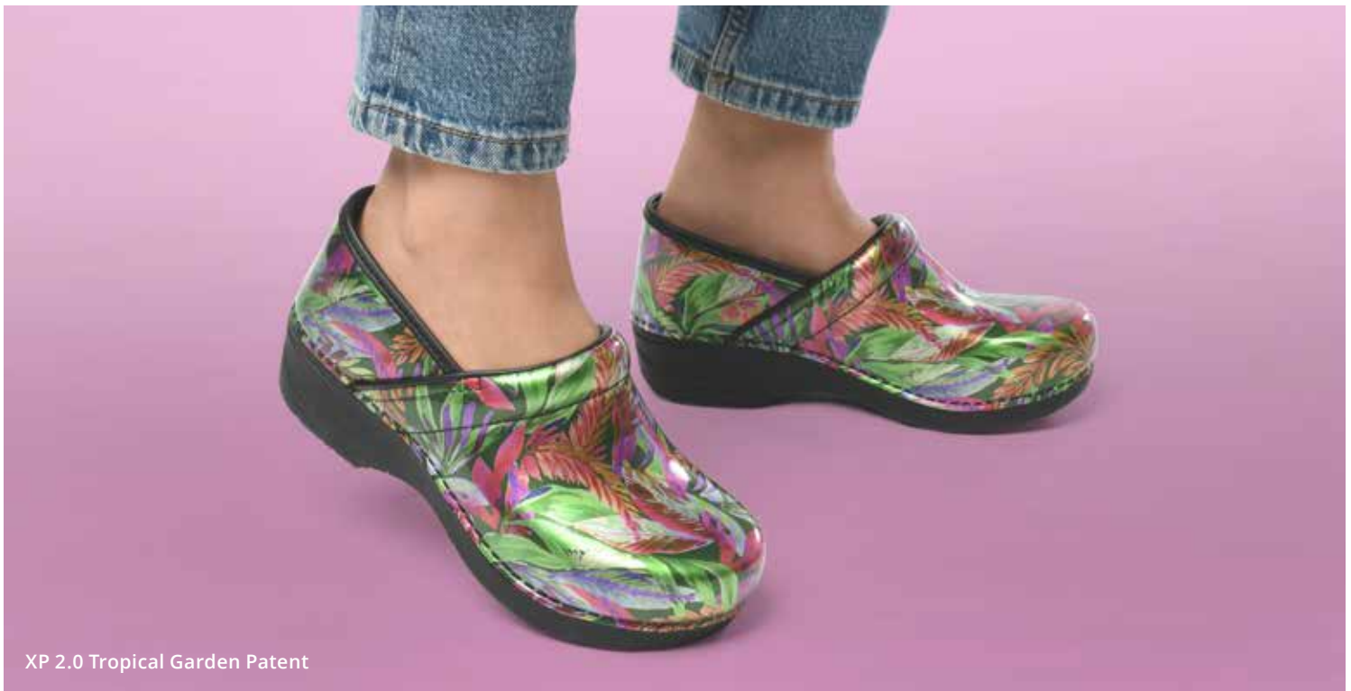
XP 2.0 Tropical Garden Patent