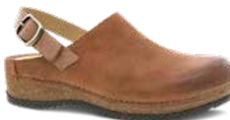
Tan Burnished Suede 9605-375300 (36-42)