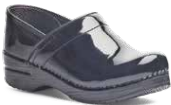
Black Patent 406-020202 (35-43)