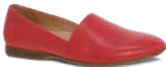
Poppy Nappa 2036-380600 (36-42)