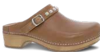
Tan Tumbled 9438-641600 (36-42)