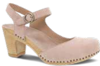
Blush Milled Nubuck 3114-171400 (36-42)