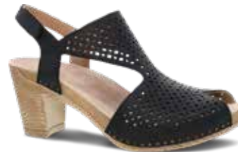
Black Burnished Nappa 3115-471400 (36-42)