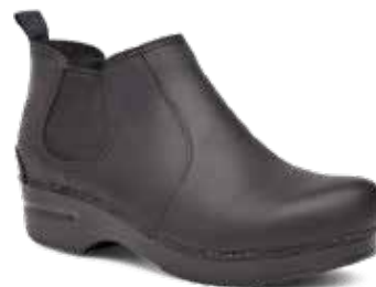
Black Oiled 232-020202 (36-42)