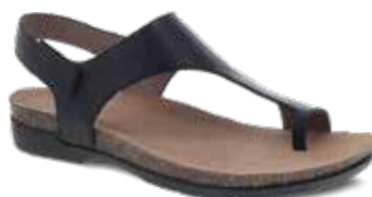
Black Waxy Burnished 6024-470200 (35-43)