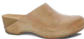
Tan Milled Burnished 1712-371600 (36-42)