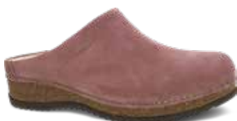
Rose Milled Nubuck 9609-965300 (36-42)