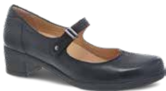
Black Burnished Nubuck 3215-100200 (36-42)