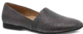
Pewter Metallic 2036-970200 (36-42)