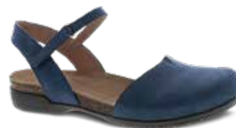
Navy Milled Nubuck 6025-755300 (36-42)