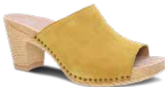
Yellow Milled Nubuck 3113-171400 (36-42)