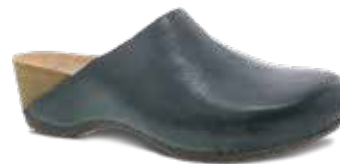
Denim Milled Burnished 1712-871600 (36-42)