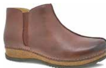
Brown Waxy Milled 9607-785300 (36-42)