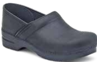
Black Oiled 206-020202 (*43-48)