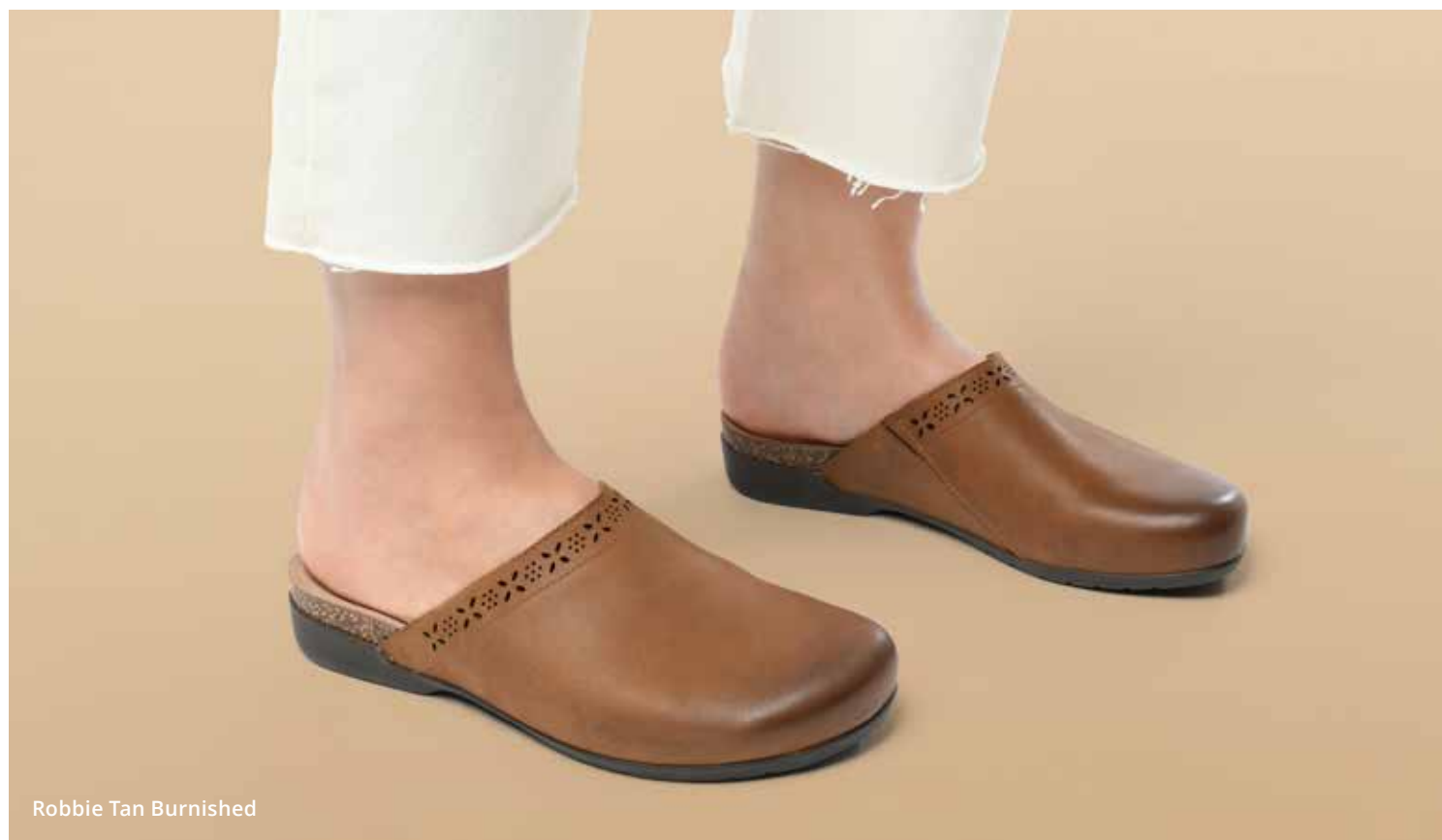
Robbie Tan Burnished