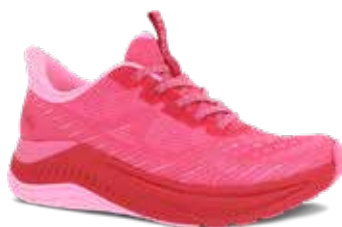
Hot Pink Mesh 4207-334896 (36-42)