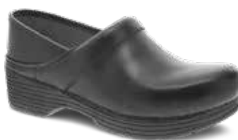
Black Leather 5200-100202 (36-42)