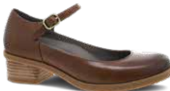
Tan Waterproof Burnished 2930-370300 (36-42)