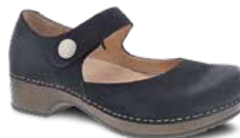
Black Burnished Nubuck 9423-477800 (36-42)