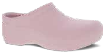
Pink Molded 4146-489600 (36-42)