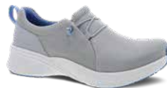
Light Grey Mesh 1945-245405 (36-42)