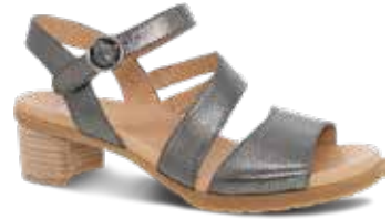
Gunmetal Metallic 5015-870300 (36-42)