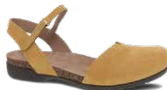
Mustard Milled Nubuck 6025-305300 (36-42)