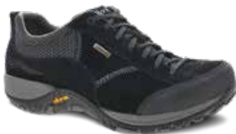
Black/Black Suede 4350-470294 (36-43) MEDIUM 4359-470294 (36-42) WIDE