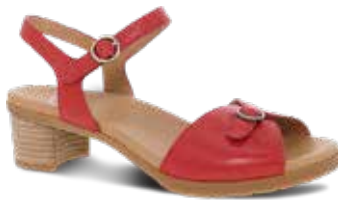
Poppy Nappa 5014-380300 (36-42)