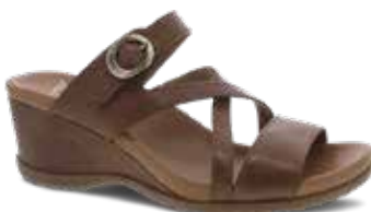
Tan Glazed Kid Leather 1610-151200 (36-42)