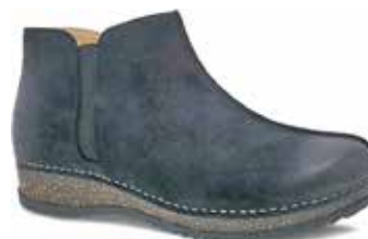
Black Burnished Suede 9607-100200 (36-42)