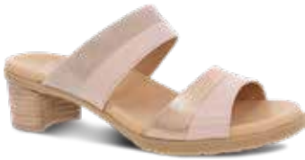
Blush Multi Leather 5013-170300 (36-42)