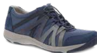
Navy Suede 4852-757575 (36-42)