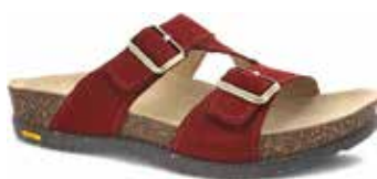
Cinnabar Suede 2106-227800 (36-42)