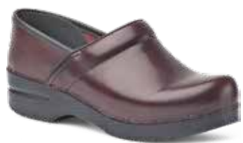
Cordovan Cabrio 806-810202 (35-43)