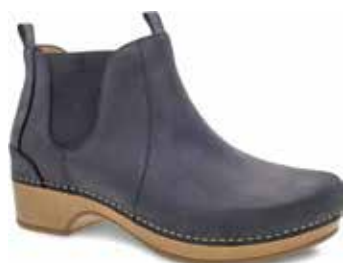
Black Oiled Pull Up 9433-021600 (36-42)