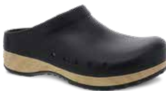
Black Molded 4145-180200 (35-43)