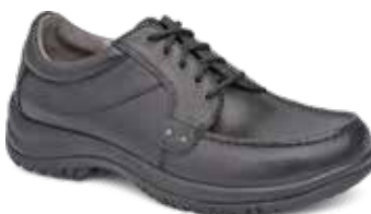
Black Full Grain 8706-020200 (41-48)