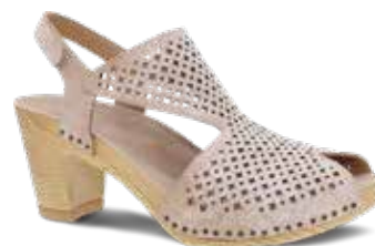
White Vintage Leather 3115-011400 (36-42)