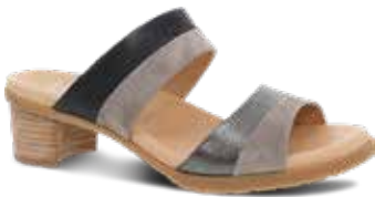
Black Multi Leather 5013-810300 (36-42)