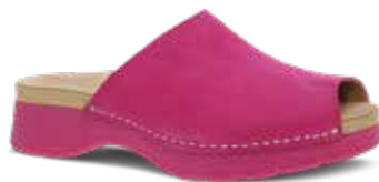
Fuchsia Milled Nubuck 7187-333300 (36-42)