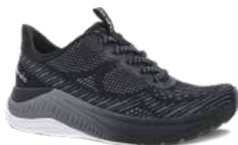
Black Mesh 4207-106194 (36-42)