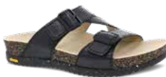
Black Croco 2106-810200 (36-42)