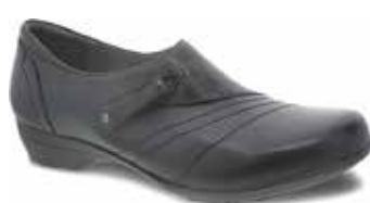
Black Milled Nappa 5500-020200 (36-42) MEDIUM 5510-020200 (36-42) WIDE