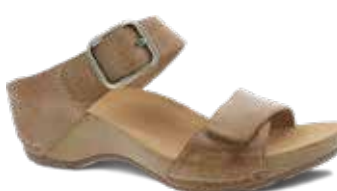
Tan Milled Burnished 1711-371600 (36-42)