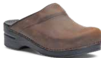
Antique Brown Oiled 250-780202 (42-47)