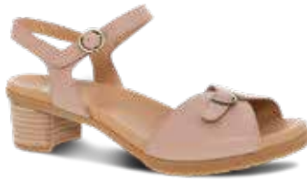
Ballet Nappa 5014-650300 (36-42)