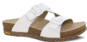
White Croco 2106-090300 (36-42)