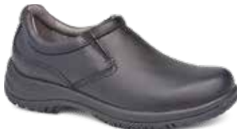
Black Smooth 8701-020200 (41-48)