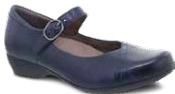
Navy Burnished Calf 5501-550200 (36-42)