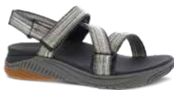
Black Multi Webbing 4917-810300 (36-42)