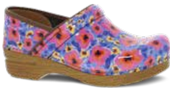
Springtime Patent* 406-901212 (36-42) Available 1/15/24