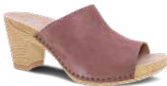
Rose Milled Nubuck 3113-961400 (36-42)