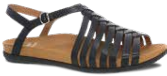
Black Calf 6221-500200 (36-42)