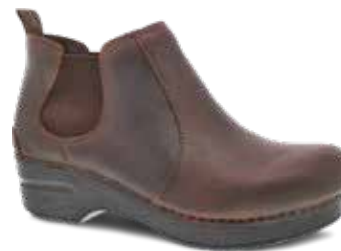
Antique Brown Oiled 232-780202 (36-42)