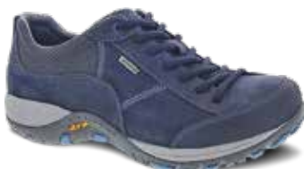
Navy Milled Nubuck 4350-751075 (36-43) MEDIUM 4359-751075 (36-42) WIDE