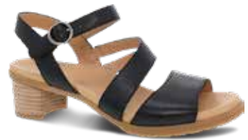
Black Nappa 5015-100300 (36-42)