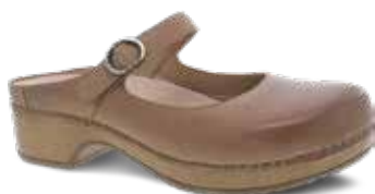
Tan Burnished Nubuck 9435-151600 (36-42)