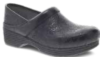
Black Floral Tooled † 5200-360202 (35-43)