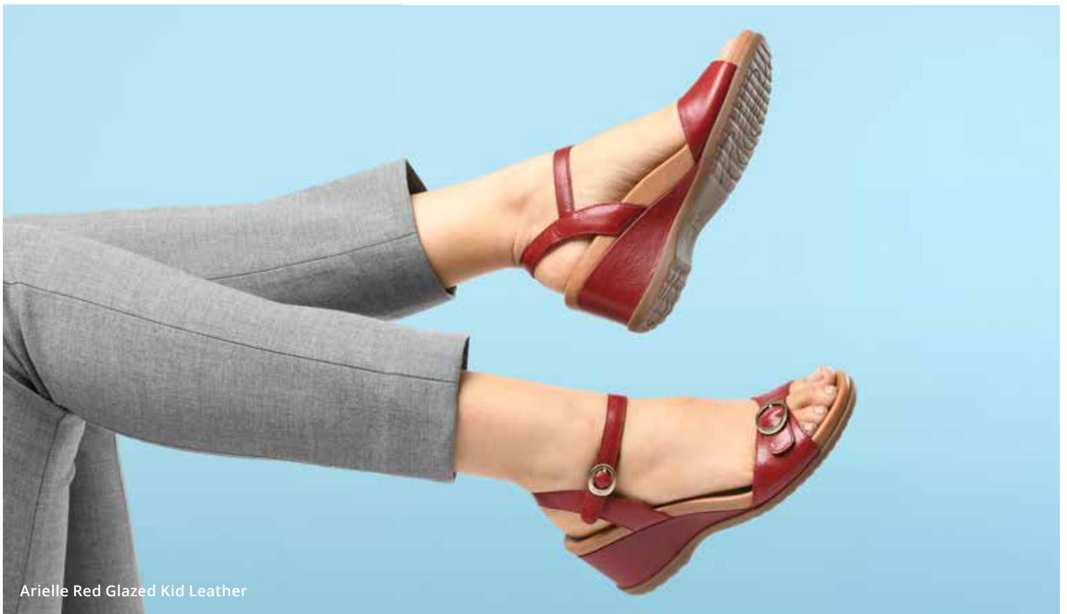
Arielle Red Glazed Kid Leather