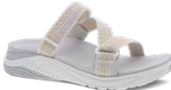
Ivory Multi Webbing 4916-612400 (36-42)