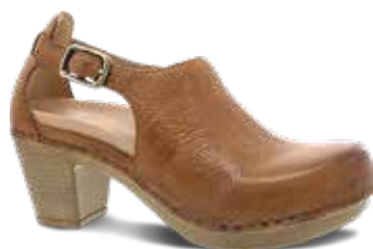
Tan Milled Burnished 1831-371500 (36-42)