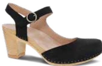
Black Milled Nubuck 3114-101400 (36-42)