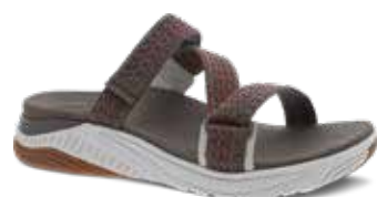
Brown Multi Webbing 4916-530300 (36-42)