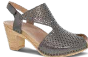
Gunmetal Metallic 3115-871400 (36-42)