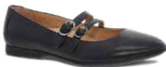
Black Nappa 2041-020200 (36-42)