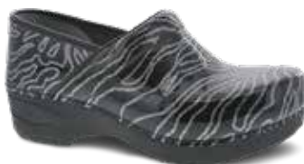
Glitter Waves Patent* 3950-140202 (36-42)