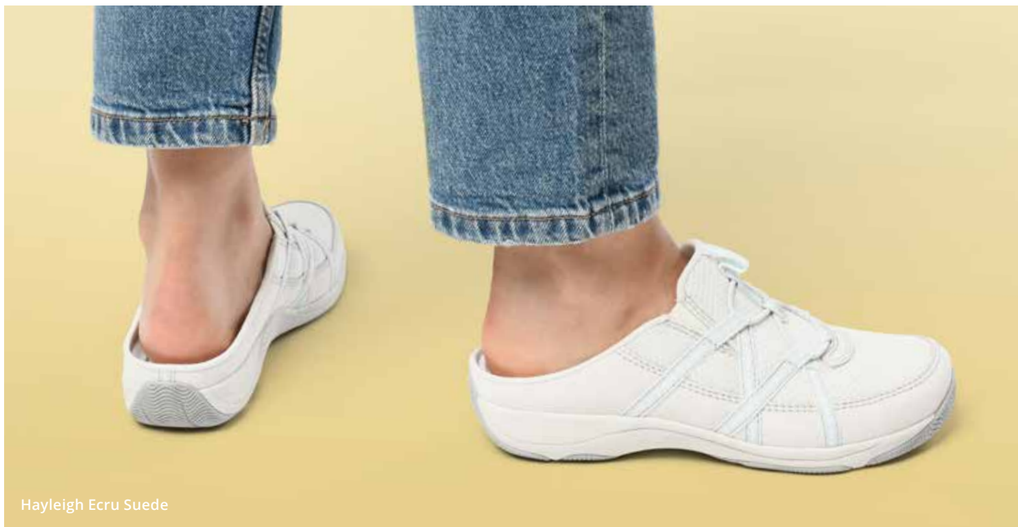
Hayleigh Ecru Suede