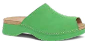
Lime Milled Nubuck 7187-464600 (36-42)