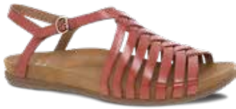
Clay Calf 6221-840300 (36-42)