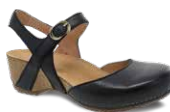
Black Milled Burnished 1710-501600 (36-42)