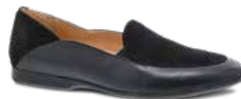
Black Glazed Kid Leather 2040-470200 (36-42)