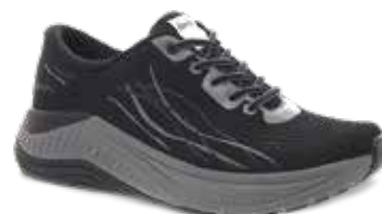
Black/Grey Mesh 4205-100294 (36-42) MEDIUM 4215-100294 (36-42) WIDE