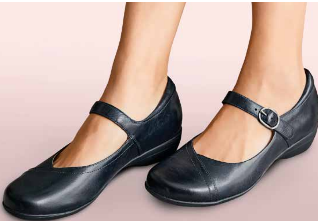
Fawna Black Milled Nappa