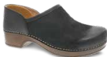
Black Burnished Suede 9431-477800 (35-43)