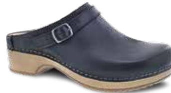
Black Burnished Nubuck 9421-101600 (35-43)