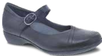
Black Milled Nappa 5501-020200 (35-43) MEDIUM 5511-020200 (36-43) WIDE