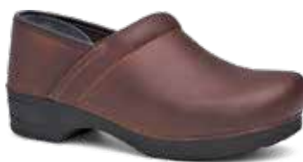
Brown Oiled 3951-787878 (42-47)