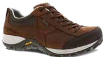
Brown Burnished Suede 4350-782320 (36-42)