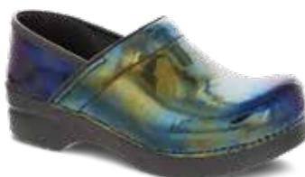
Petrol Patent 406-110202 (35-43)