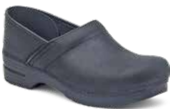
Black Oiled 206-020202 (35-42*) MEDIUM 212-020202 (36-43) NARROW 299-020202 (36-43) WIDE