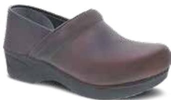
Brown Waterproof Pull Up † 3950-070202 (35-43)