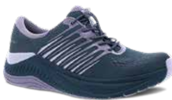
Denim Mesh 4206-718585 (36-42)