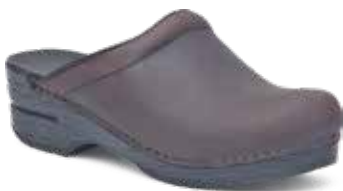
Antique Brown Oiled 247-780202 (35-42)