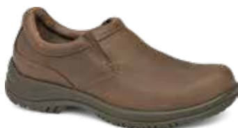
Brown Distressed 8701-787800 (41-48)