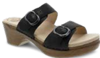
Black Full Grain 9841-022200 (36-42)