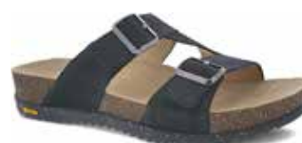
Black Suede 2106-470200 (36-42)