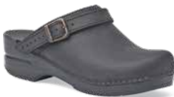
Black Oiled 238-020202 (35-42)