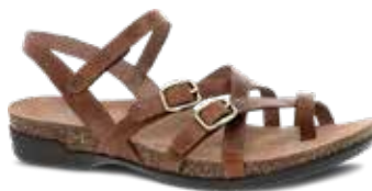
Tan Waxy Burnished 6029-155300 (36-42)