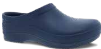
Blue Molded 4146-545400 (36-42)