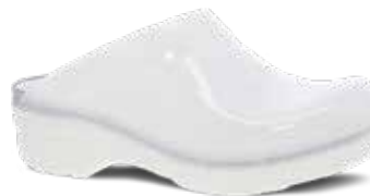
White Translucent 047-010101 (36-42)