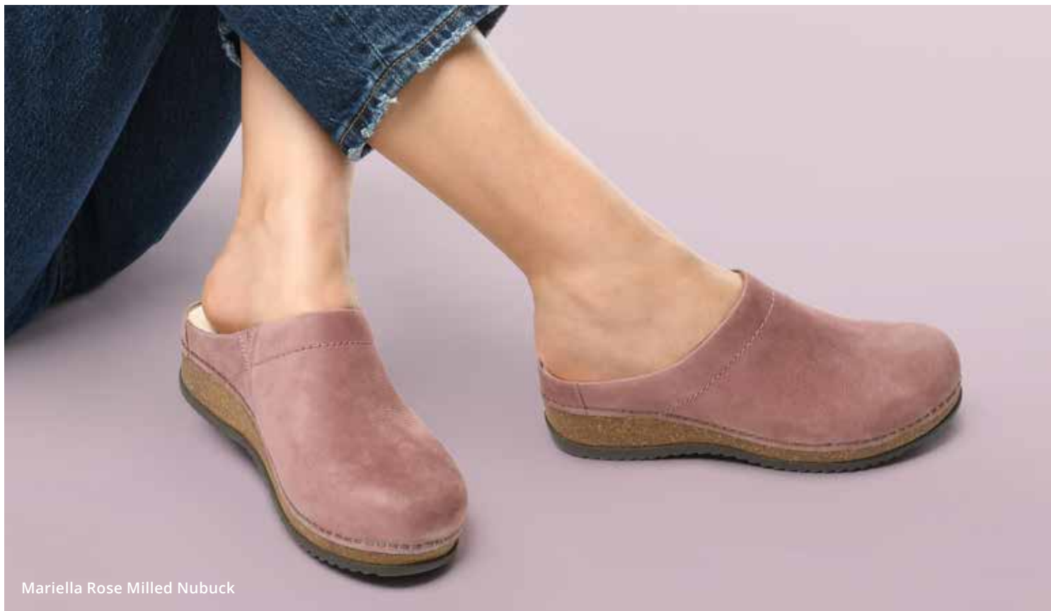
Mariella Rose Milled Nubuck