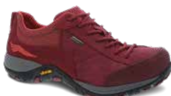
Red Burnished Suede 4350-220222 (36-42)