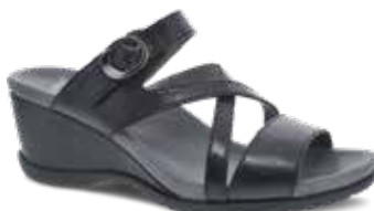
Black Glazed Kid Leather 1610-500200 (36-42)