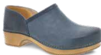
Navy Burnished Suede 9431-751600 (36-42)