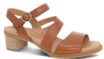
Luggage Nappa 5015-640300 (36-42)