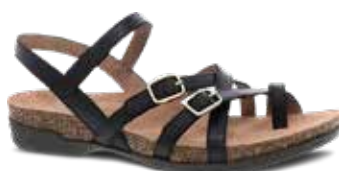
Black Waxy Burnished 6029-475300 (36-42)