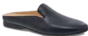
Black Milled Nappa 2038-500200 (36-42)