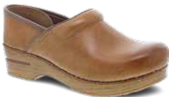
Honey Distressed † 306-581464 (35-43) MEDIUM 399-581464 (36-43) WIDE