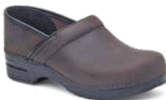
Antique Brown Oiled 206-780202 (*43-48) MEDIUM 299-780202 (*43-47) WIDE