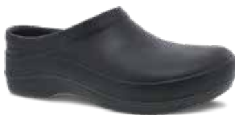
Black Molded 4146-020200 (36-42)