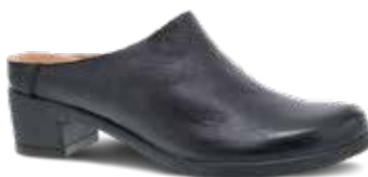
Black Burnished Nubuck 3218-100200 (36-42)