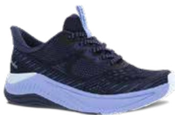
Navy Mesh 4207-757505 (36-42)