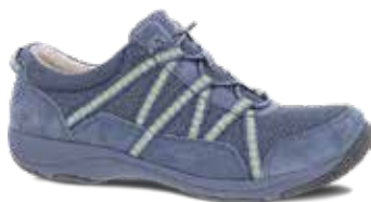
Blue Suede 4854-391017 (36-42)