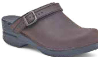
Antique Brown Oiled 238-780202 (35-42)