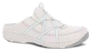
Ecu Suede 4855-619434 (36-42)