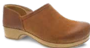
Tan Burnished Suede 9431-151600 (35-43)