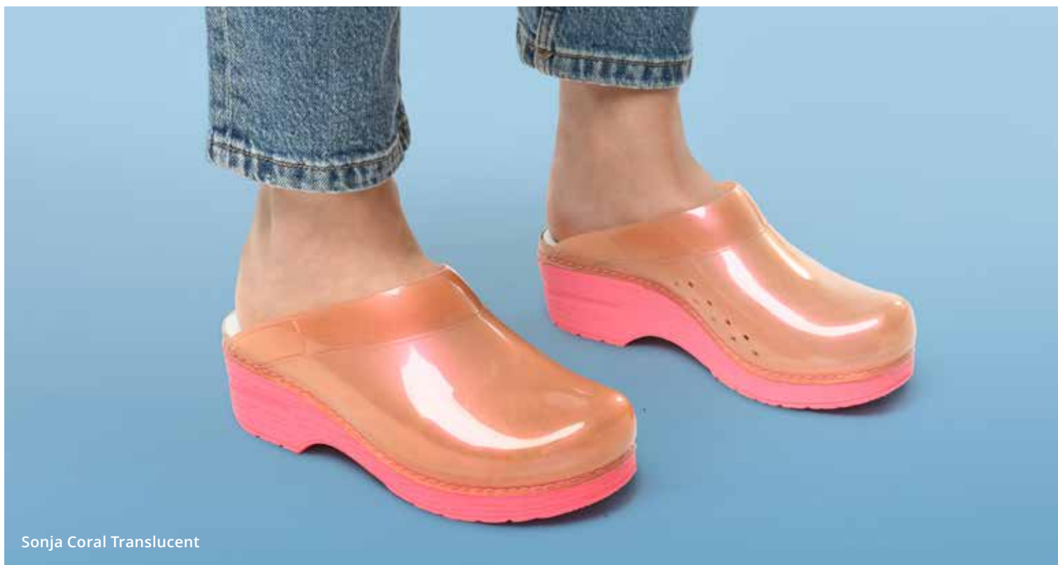
Sonja Coral Translucent