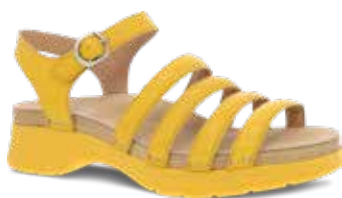
Yellow Nappa 7186-171700 (36-42)