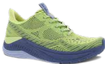
Yellow Mesh 4207-175417 (36-42)