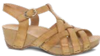
Tan Milled Burnished 1713-371600 (36-42)