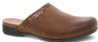
Tan Burnished Nubuck 6028-155300 (36-42)