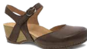
Brown Milled Burnished 1710-531600 (36-42)