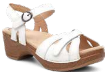
White Full Grain 9849-012200 (36-42)