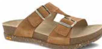
Tan Suede 2106-370300 (36-42)