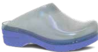
Sky Translucent 047-095409 (36-42)