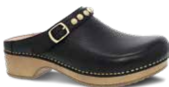
Black Tumbled 9438-501600 (36-42)