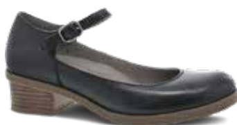
Black Waterproof Tumbled 2930-472300 (36-42)