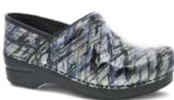
Crisscross Patent* 706-620202 (36-42)