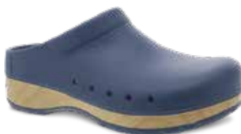
Blue Molded 4145-545400 (36-42)