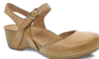
Tan Milled Burnished 1710-371600 (36-42)