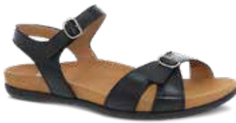
Black Calf 6222-500200 (36-42)