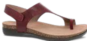
Cinnabar Waxy Burnished 6024-045300 (36-42)