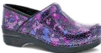
Dotty Abstract Patent* 606-410202 (36-42)