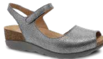
Pewter Metallic 1511-979400 (36-42)