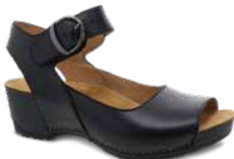
Black Burnished Calf 1705-020200 (36-42)