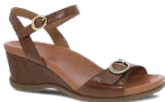
Tan Glazed Kid Leather 1613-151200 (36-42)