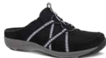
Black Suede 4855-100285 (36-42)