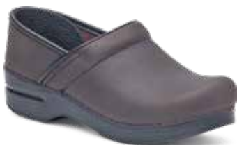
Antique Brown/Black 206-780202 (35-42*) MEDIUM 212-780202 (36-43) NARROW 299-780202 (36-42*) WIDE