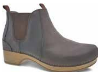
Brown Oiled Pull Up 9433-781600 (36-42)