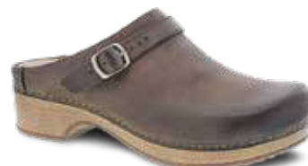
Mushroom Burnished Nubuck 9421-871600 (36-42)