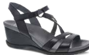
Black Glazed Kid Leather 1611-500200 (36-42)