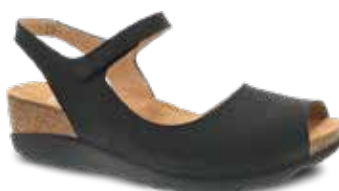
Black Milled Nubuck 1511-470200 (36-42)