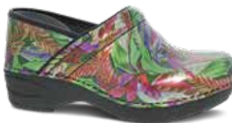
Tropical Garden Patent* 3950-280202 (36-42) Available 2/5/24