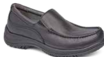
Black Full Grain 8703-020200 (41-48)