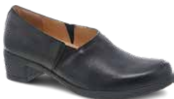
Black Burnished Nubuck 3216-100200 (36-42)