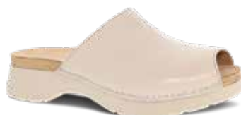
Ivory Nappa 7187-656100 (36-42)