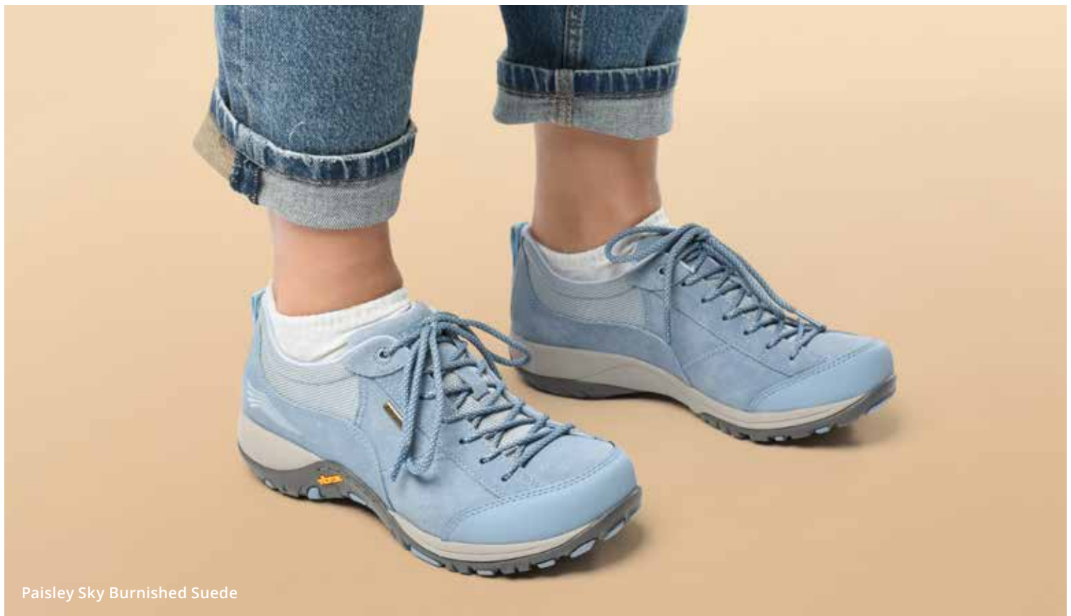
Paisley Sky Burnished Suede