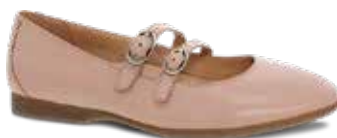
Ballet Nappa 2041-650600 (36-42)