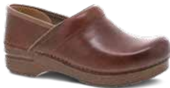
Saddle Full Grain † 106-531412 (35-43)