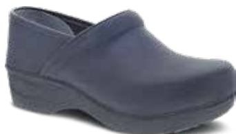
Navy Waterproof † 3950-730202 (36-42)