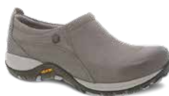
Taupe Burnished Suede 4353-152015 (36-42)