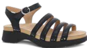
Black Nappa 7186-100200 (36-42)