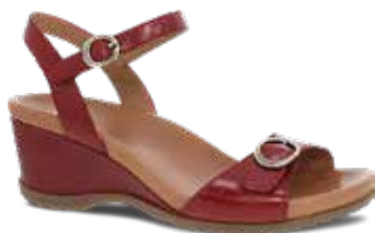
Red Glazed Kid Leather 1613-221200 (36-42)