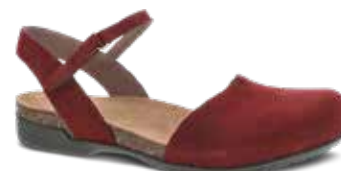
Cinnabar Milled Nubuck 6025-225300 (36-42)