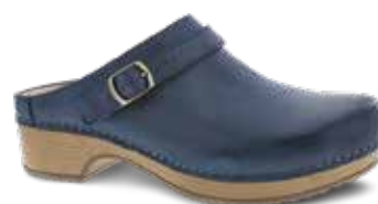
Navy Burnished Full Grain 9421-541600 (36-42)