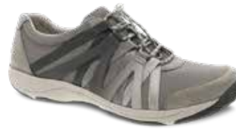
Grey Suede 4852-941094 (36-42)