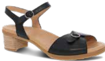
Black Nappa 5014-100300 (36-42)