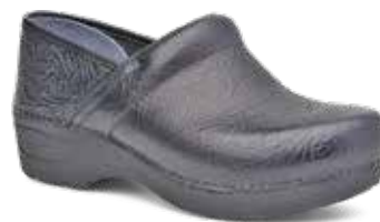
Black Floral Tooled 3950-360202 (35-43)