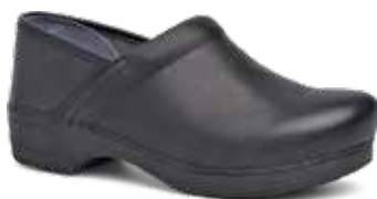
Black Burnished Nubuck 3951-100202 (42-47)