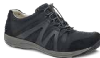
Black/Black Suede 4852-360295 (36-42) MEDIUM 4862-360295 (36-42) WIDE