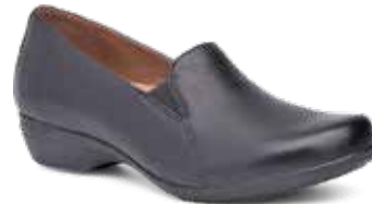
Black Milled Nappa 5502-020200 (36-42)