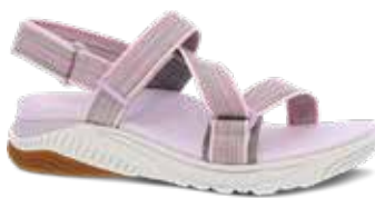
Lilac Multi Webbing 4917-850300 (36-42)