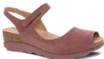
Rose Milled Nubuck 1511-969600 (36-42)