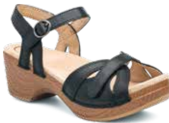
Black Full Grain 9849-022200 (36-42)