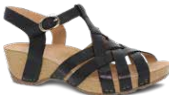
Black Milled Burnished 1713-501600 (36-42)