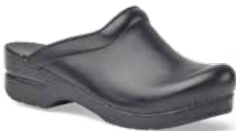
Black Cabrio 847-020202 (35-42)