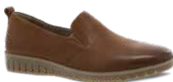
Tan Burnished Calf 9142-370300 (36-42)