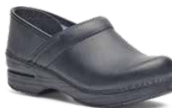
Black Box 006-020202 (35-42*) MEDIUM 099-020202 (36-43) WIDE