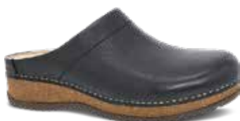
Black Nappa 9609-365300 (36-42)