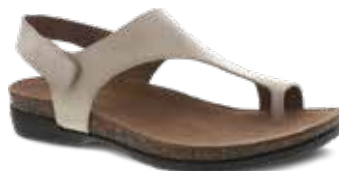
Linen Milled Burnished 6024-445300 (36-42)