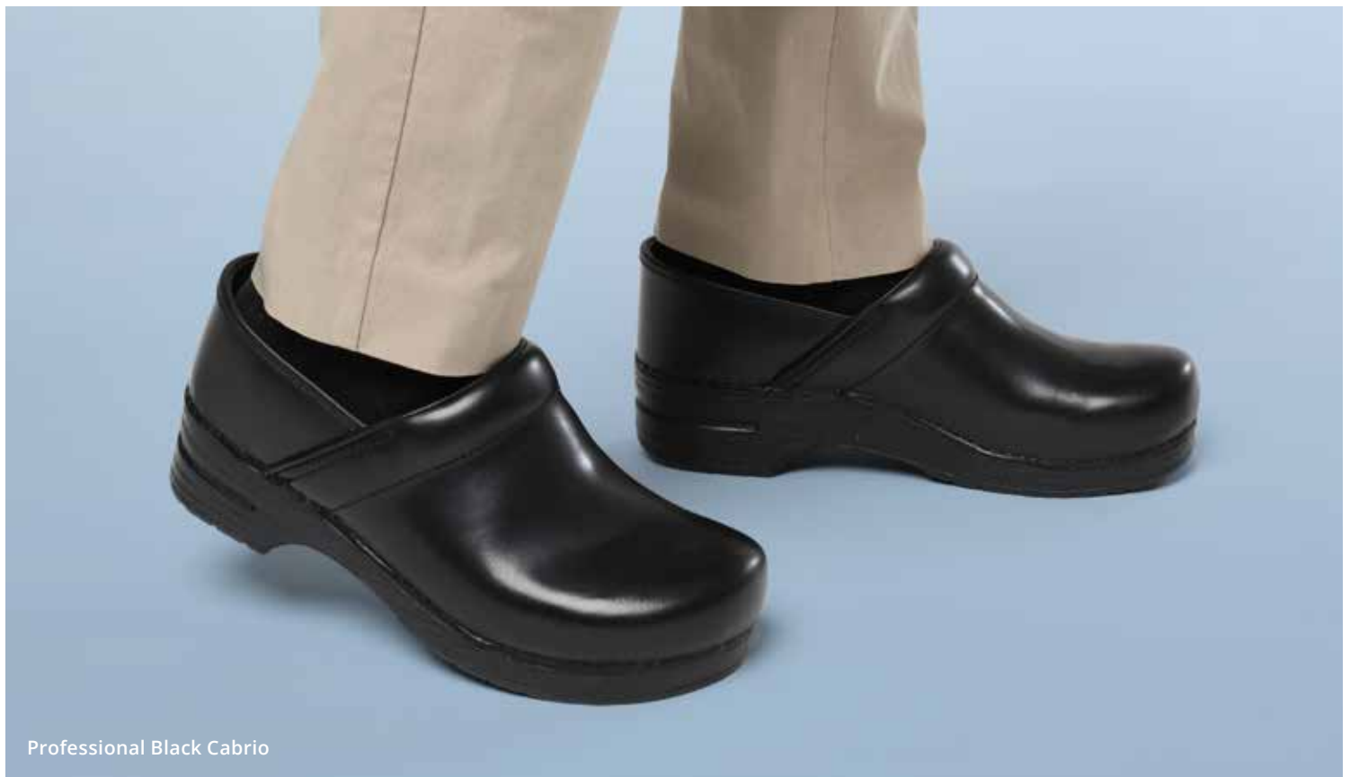
Professional Black Cabrio