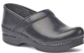
Black Cabrio 806-020202 (35-42*) MEDIUM 812-020202 (35-42) NARROW 899-020202 (36-42*) WIDE