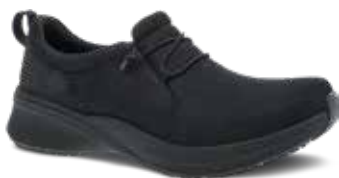
Black Mesh 1945-470202 (36-42)