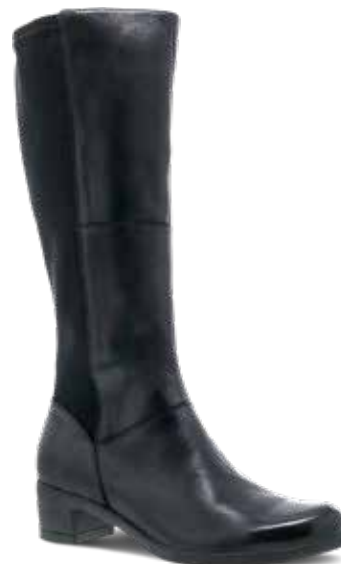
Black Burnished Nubuck 3219-100200 (36-42)