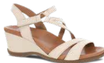
Ivory Nappa 1611-651200 (36-42)