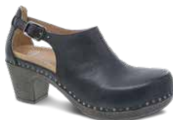
Black Milled Burnished 1831-029400 (36-42)