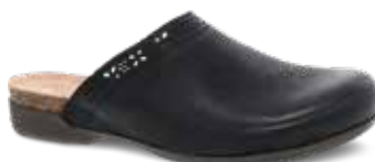
Black Burnished Nubuck 6028-105300 (36-42)