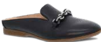
Black Nappa 2042-020200 (36-42)