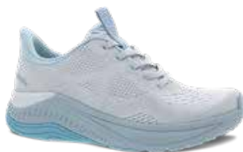
White Mesh 4207-011934 (36-42)