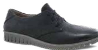
Black Burnished Calf 9140-507800 (36-42)