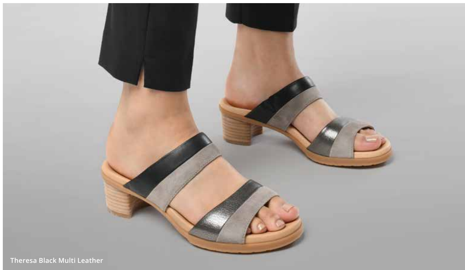
Theresa Black Multi Leather