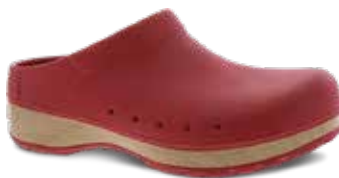
Red Molded 4145-046800 (36-42)