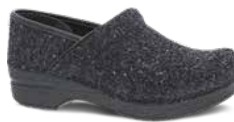
Black Glitter † 306-100202 (36-42)