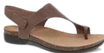
Stone Waxy Burnished 6024-795300 (35-43)