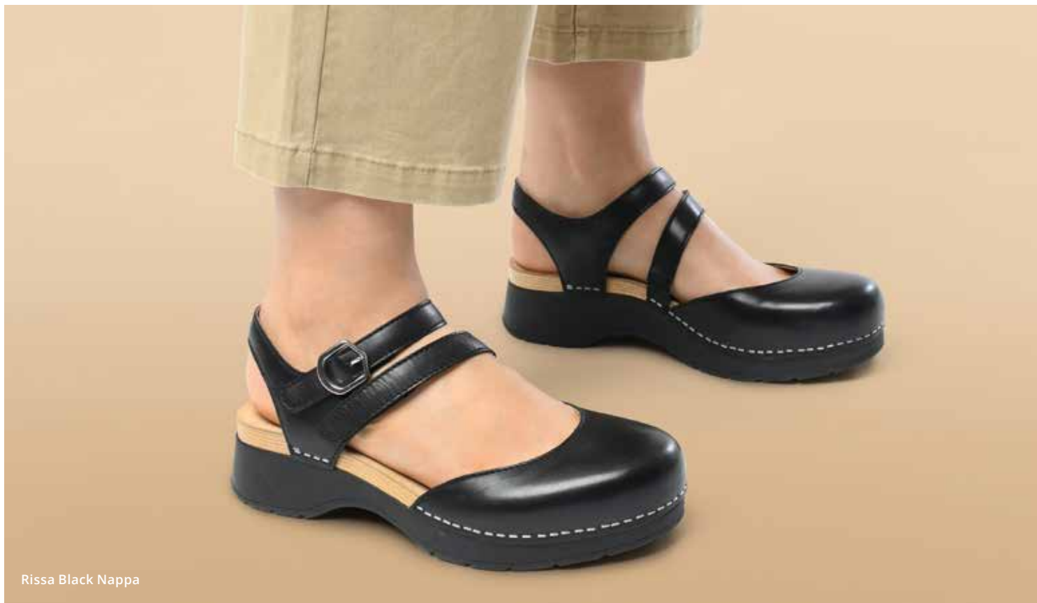
Rissa Black Nappa