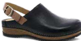
Black Waxy Milled 9605-500200 (36-42)