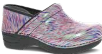
Pastel Blur Patent* 3950-740202 (36-42) Available 1/2/24