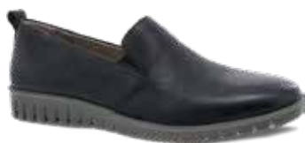
Black Burnished Calf 9142-507800 (36-42)