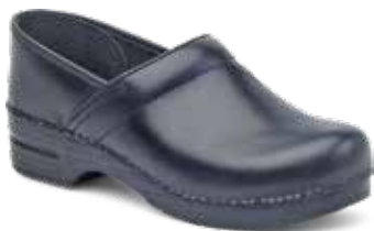
Black Cabrio 806-020202 (*43-48) MEDIUM 899-020202 (*43-47) WIDE