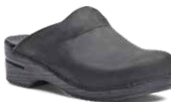
Black Oiled 250-020202 (42-47)