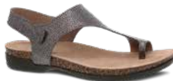
Pewter Metallic 6024-975300 (36-42)