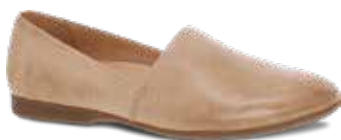
Taupe Milled 2036-200600 (36-42)