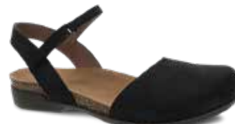
Black Nubuck 6025-105300 (36-42) 35 & 43 Available 2/5/24