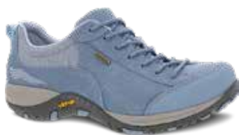
Sky Burnished Suede 4350-099409 (36-42)