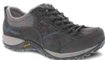
Grey/Blue Suede 4350-241005 (36-42)