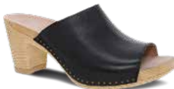
Black Burnished Nappa 3113-471400 (36-42)