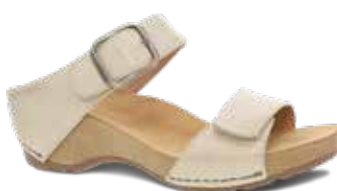
Linen Milled Burnished 1711-441600 (36-42)