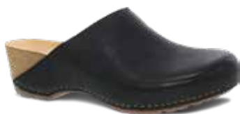
Black Milled Burnished 1712-501600 (36-42)