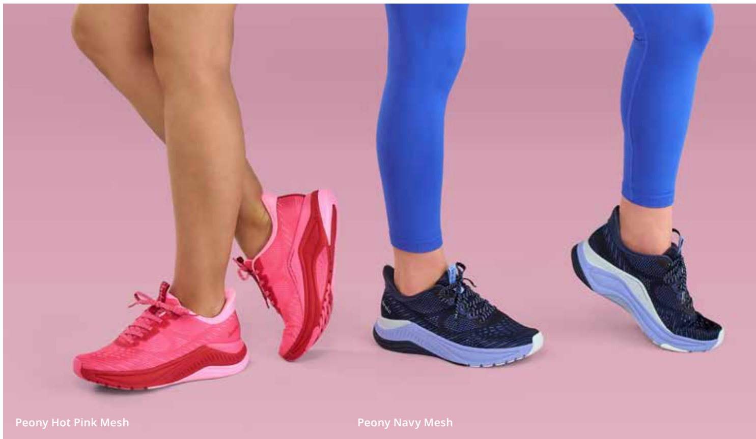
Peony Hot Pink Mesh