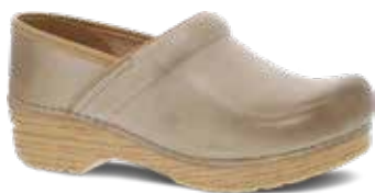
Sand Milled Burnished † 106-031421 (36-42) Available 11/6/23