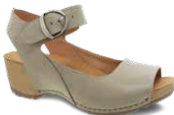
Khaki Burnished Nubuck 1705-641600 (36-42)