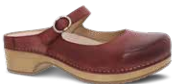
Cinnabar Burnished Nubuck 9435-221600 (36-42)