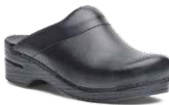
Black Box 050-020202 (42-47)