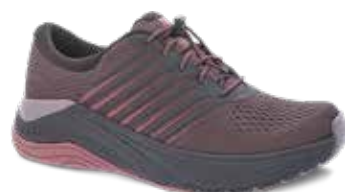
Raisin Mesh 4206-454896 (36-42)