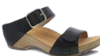
Black Milled Burnished 1711-501600 (36-42)