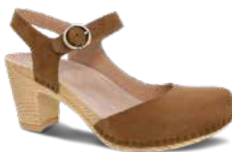
Tan Milled Nubuck 3114-371400 (36-42)