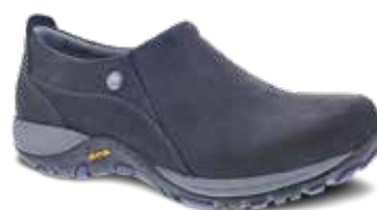
Black Milled Nubuck 4353-100294 (36-42)