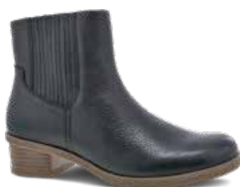
Black Waterproof Tumbled 2931-472300 (36-42)