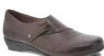
Chocolate Burnished Calf 5500-230200 (36-42)