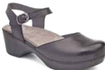
Black Soft Full Grain 9840-320200 (35-43)