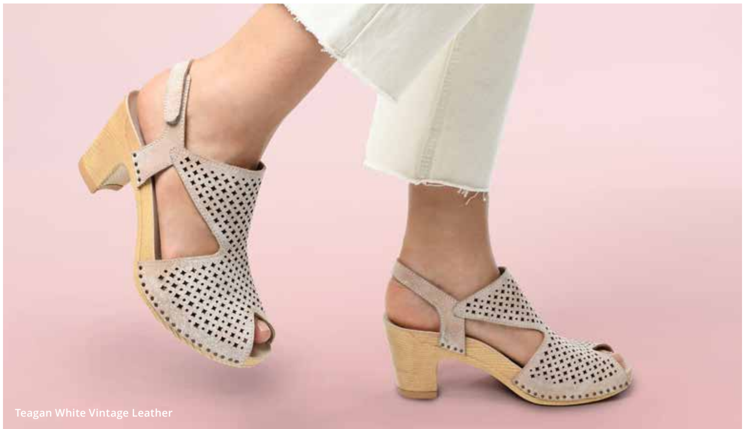
Teagan White Vintage Leather