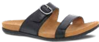
Black Calf 6220-500200 (36-42)