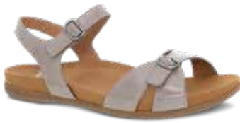
Stone Calf 6222-790300 (36-42)