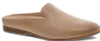
Taupe Milled 2038-200600 (36-42)