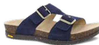
Navy Suede 2106-757800 (36-42)