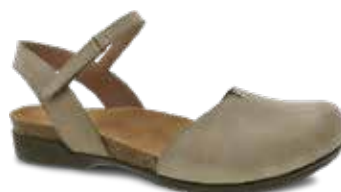
Taupe Milled Nubuck 6025-165300 (36-42)