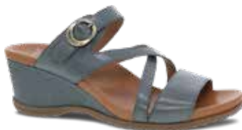
Denim Glazed Kid Leather 1610-721200 (36-42)